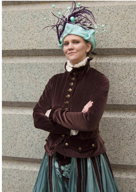
1567 Plunderhosen shown in the Historical Masquerade at Costume Con 29.

In 2017 my focus has been primarily on putting in new avenues for building our community. We now have Slack available for internal guild communication with 103 of our members having signed up through the invitations that were sent out. (If you didn't receive one, please contact me at icg-president@costume.org ) We also have a Facebook discussion group connected to our page has been set up as well. Please join us there and share your thoughts, ideas, and projects with the rest of us! Now as 2018 approaches my goals are shifting to prioritize the website's upgrade. Aside from the visual facelift that switching to WordPress will provide, the gallery is in need of software upgrades that can support the incredible amount of material available there and it's a large project that has needed attention for a while now.