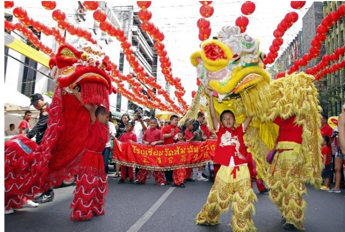
Children performing the Lion Dance at a Chinese New Year Celebration.

scheme is abundant at the Chinese New Year festivals.