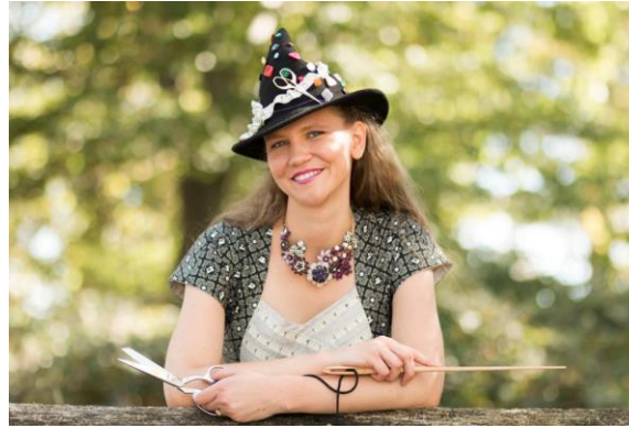
Stitch Witchery.

First off, the most familiar: Facebook. Whether you use it or not, you're probably familiar with how it works. While many