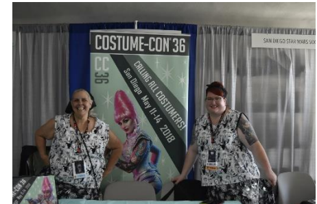
CC36 booth at Comic-Con.

We met, saw and conversed with a lot of great costumers as we talked to them about Costume-Con 36.