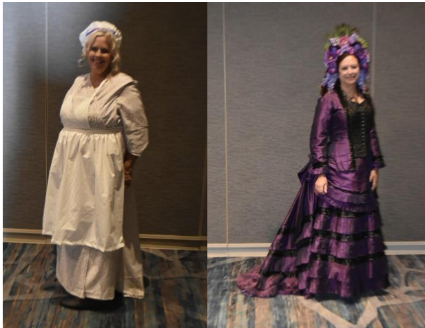
Romance Writers of America historical fashion show.

During the last three weeks of July, I had a costuming event every weekend. It started with a historical fashion show for the Romance Writers of America. It was the debut of the Bluebird dress, a dress that was inspired by the hat I bought last January.