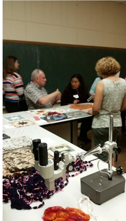
Panels at conventions and public workshops can be excellent ways to spread costuming information.