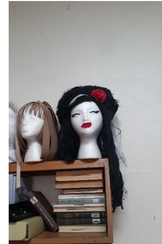
A wig panel can be a great addition to convention programming.