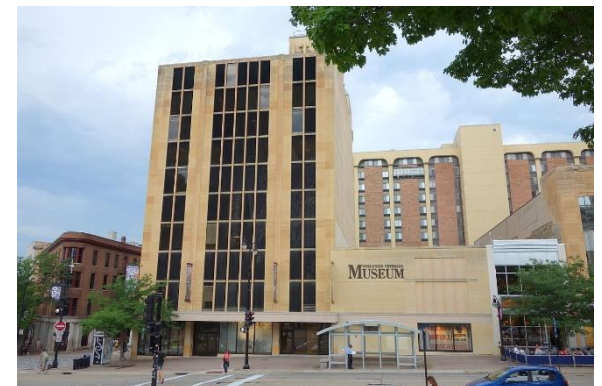
Wisconsin Veteran's Museum.