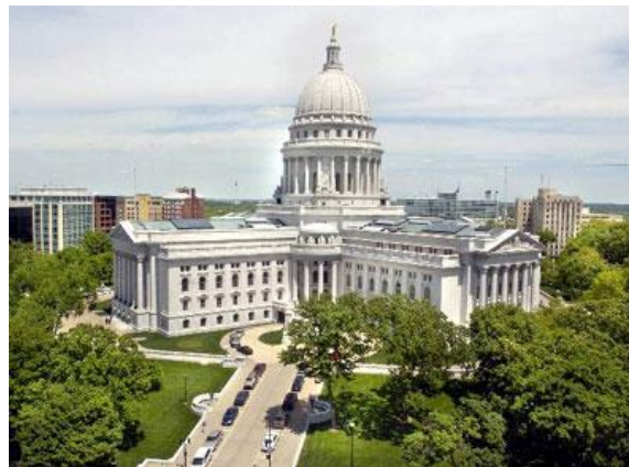
Wisconsin State Capitol.

Return: 3pm to return to the Marriott around 3:30pm