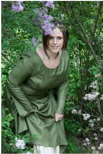
The UW Arboretum.

We are not offering tours to these locales, but highly recommend visiting them if you have time and want to explore between panels and masquerades. There's an enormous list of area attractions at http://www.costumecon34.com/location-and-travel/attractions/ , including sites of interest to historical costumers and history buffs, nature nuts, and anyone looking for a good time in the Greater Madison Area.