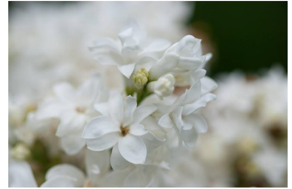
The Wonder of Nature.

Looking to be part of the action behind the scenes? Registering late and want to reduce the registration fee? Be part of our Workforce! We have volunteer opportunities for a wide variety of skills and interests: