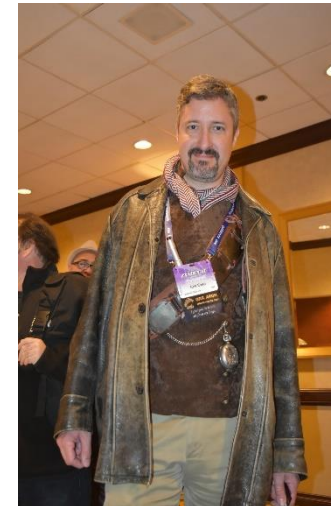
A War Doctor costume.

Each evening, there were gatherings with the "stars" and you could also pay for the privilege of an autograph or a picture. Saturday was much the same as Friday although we changed the rules of the scavenger hunt to finding the 3 photos in order to get a ribbon. After they had collected all 6 ribbons, then they could choose a charm. There were quite a few of the War Doctors wandering the halls and one reminded me of an ICG member: