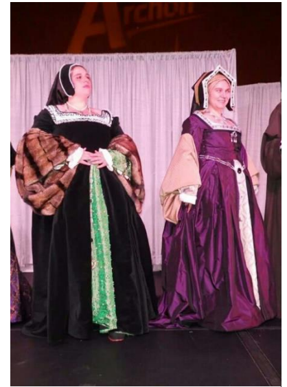
Historical Costumes.