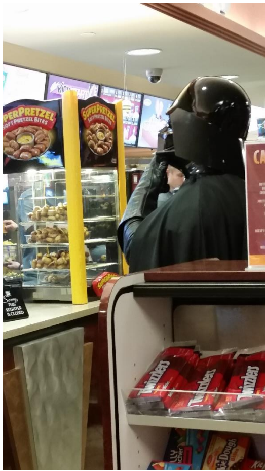
A Darth Vader costumer chooses between popcorn and pretzels.

Be sure to keep an eye on the Costume-Con 34 website and Facebook page for updates, videos, and information about the Madison area.