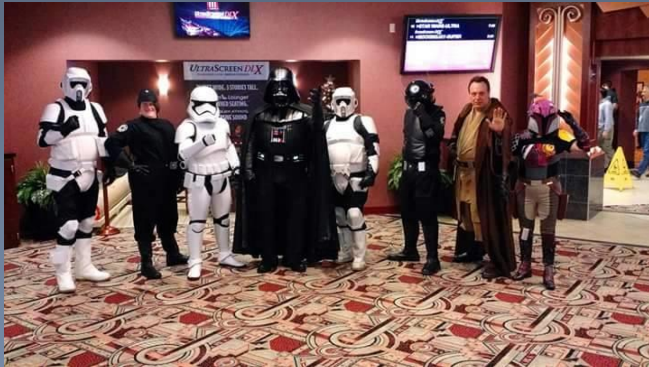
Members of the 501 st Legion - Wisconsin Garrison at the Star Wars Episode VII premiere.