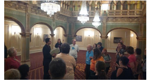
Regency Dance space at The Davenport.

Originally, I was worried that this hotel would be like my hotel experience in Toronto, where the rooms were barely large enough to squeeze around the bed, and the closet was miserably small. My fears turned out to be unfounded.