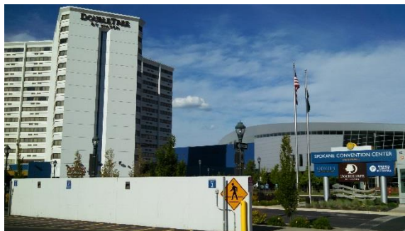
The DoubleTree.

to stay at if they can. Some programming will be happening in the DoubleTree, with late night items that cannot happen in the Convention Center. Gaming is here. Filking will be here in the evening hours. I believe meetups will be here, too.