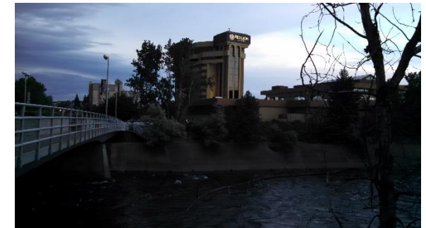
Red Lion at the Park.

They had a sign in the lobby which had a newspaper article explaining that a financial group bought twelve of the Red Lions, so they could be upgraded. Red Lion will still run the operation, but some nice stuff is being put in. My room had nice stone counter tops in the bathroom and on a hall platform just outside the bathroom. I am not sure this was one of the upgraded rooms or not.