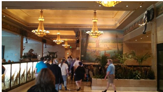
Davenport Towers Lobby.

If you like a tasteful African theme, you should enjoy this hotel. The African is modest, not hit you over the head with a sledge hammer. The lobby had a lot of hard surfaces, so it was rather noisy. The bar had seating and carpeting in its space, but it was still hard to have a conversation in the lobby. Also, I did not see many places to sit without being in the bar. Very pretty, very clean, very sleek, very hard, very noisy. Kitty corner to the original Davenport.