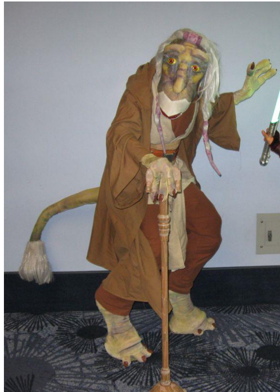
Master Tera Sinube outside in the hall waiting for the workmanship judging.

surprise that anyone would attempt it. But I must admit also that it was fortuitously chosen for this contest. One of the stage judges was the lead voice actress for the episode that this character is from. Another one was the cartoon's lead writer and also wrote "Lightsaber Lost". I cannot discount the possibility that they might have been biased.