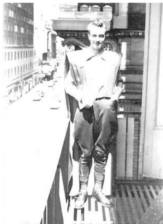
Forrest J. Ackerman, first fan to attend a Worldcon in costume (Galactic Patrol uniform from the world of E. E. "Doc" Smith's Lensman stories.) N.Y., 1939

For anyone who does not know, the masquerade, as a competitive and spectator event at fan-conventions, began when Forrest J. Ackerman wore a 'hall costume' at the first World Science-Fiction Convention (NY CON I) in New York City in 1939.