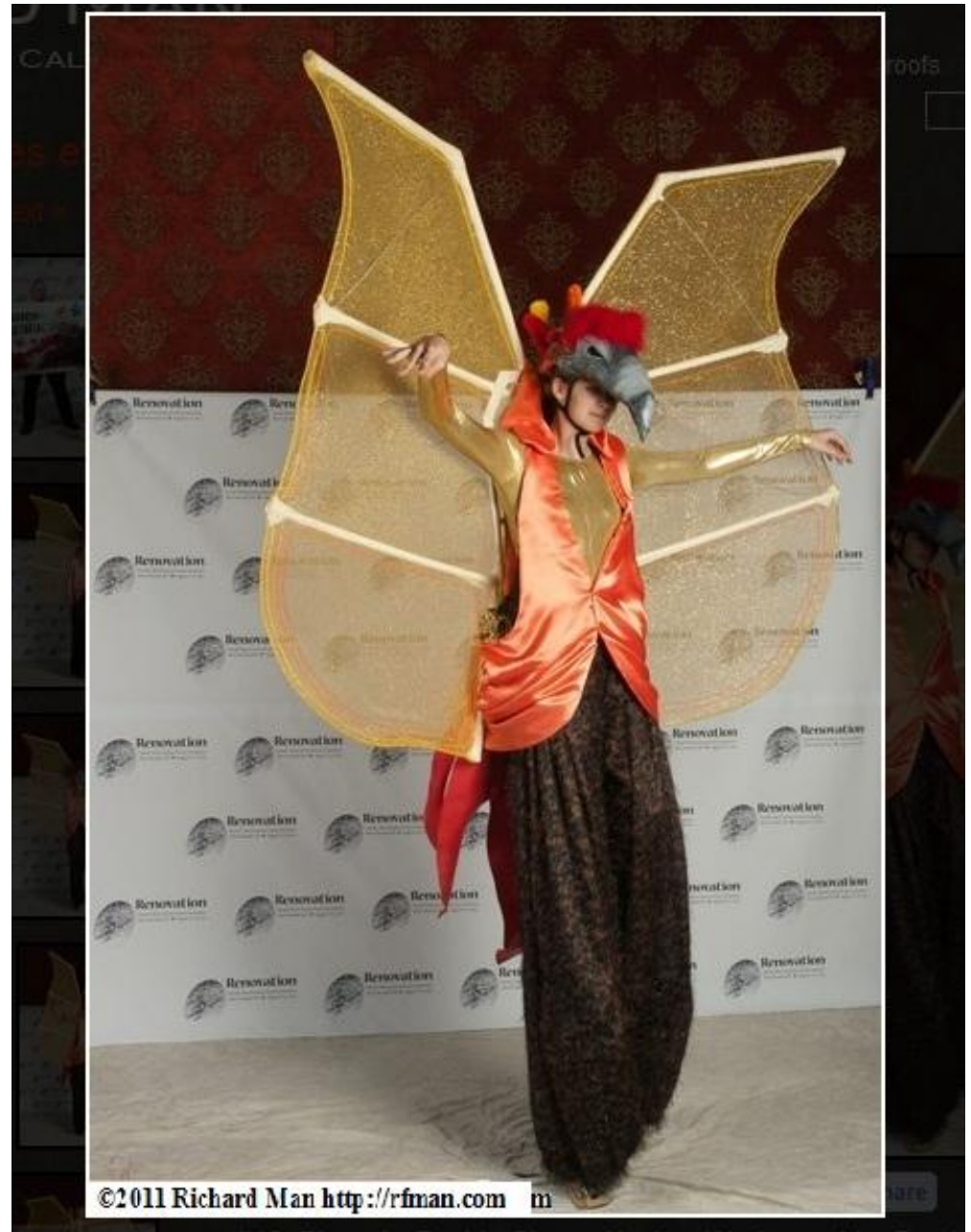
#10, Phoenix, Best in Class - Novice, Workmanship; Persistence of Vision - Novice, Presentation