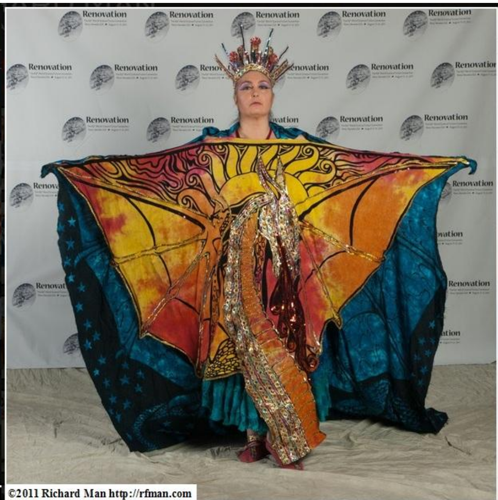
#21, Nothing To Wear, Journeyman. Best in Class - Journeyman, Presentation.

Note that the above Team also won Workmanship--Best in Show