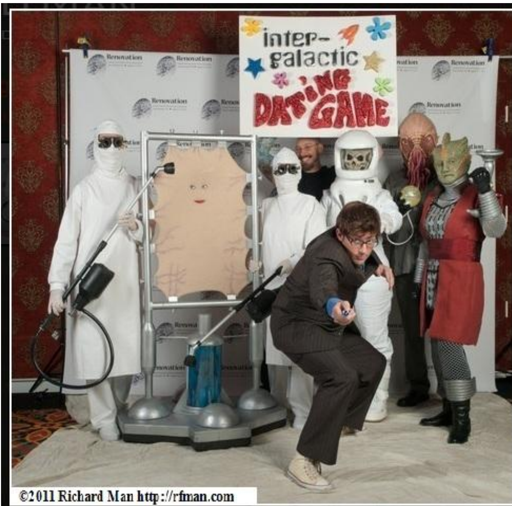
#28, Intergalactic Dating Game, Best in Show Workmanship, Best in Class - Master, Presentation