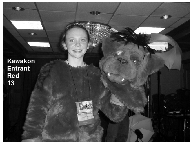
Kawakon Entrant Red 13