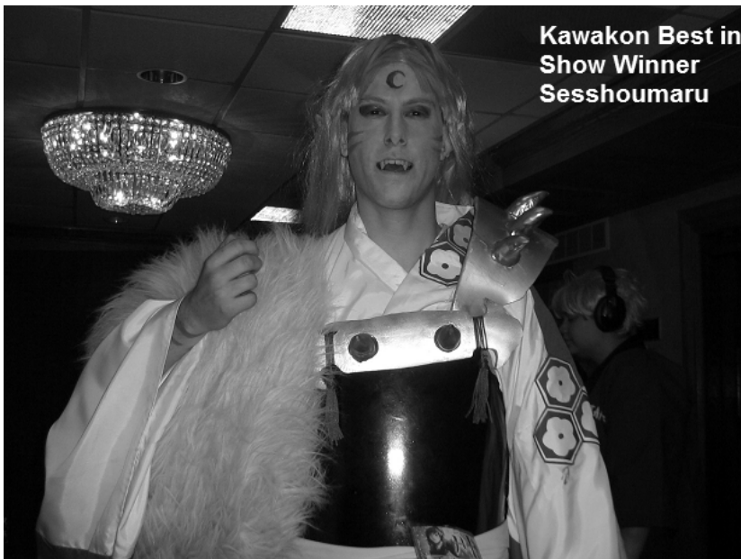
Kawakon Best in Show Winner Sesshoumaru