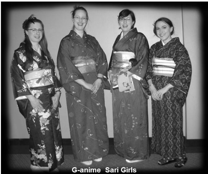
G-anime Sari Girls